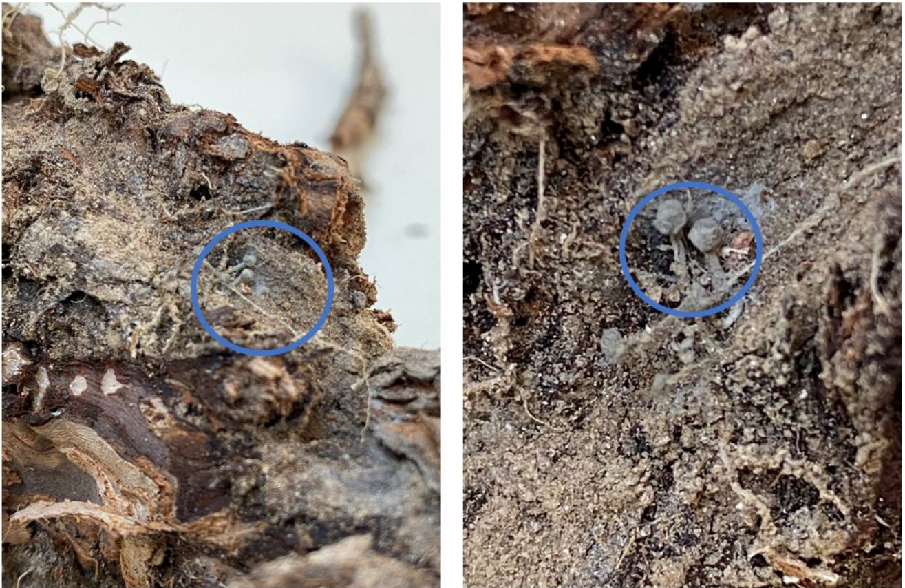
Fig. 1: Vine roots infected with R. subterranea . The circles indicate the presence of mazaedia.